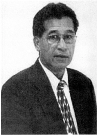
President Emanuel Mori

The people of the FSM take great pride in their special traditional link with the people of Japan, the result of Japanese pres-