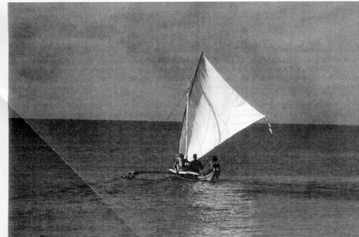
YAP FISHERMEN head out to sea in their outrigger.

KYOWA SHIPPING CO., LTD. TOKYO OFFICE: Phone: 81-3-5510-1991 Fax: 81-3-5510-2002 E-mail: inquiry@kyowa-line.co.jp http://www.kyowa-line.co.jp/ OSAKA BRANCH: Phone: 81-6-6533-5821 Fax: 81-6-6533-2352